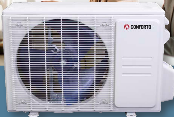
Condensing Unit (Exterior)