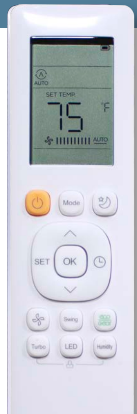
Included Handheld IR Remote

Convenience is yours, utilize the Follow Me feature, which detects room temperature from the remote control and adjusts for your personal comfort wherever you are in the room.