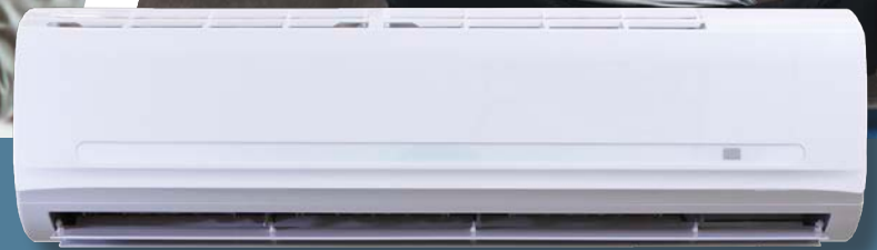
(36K Btu/h Pictured)