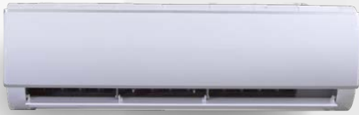
(9K Btu/h Pictured)